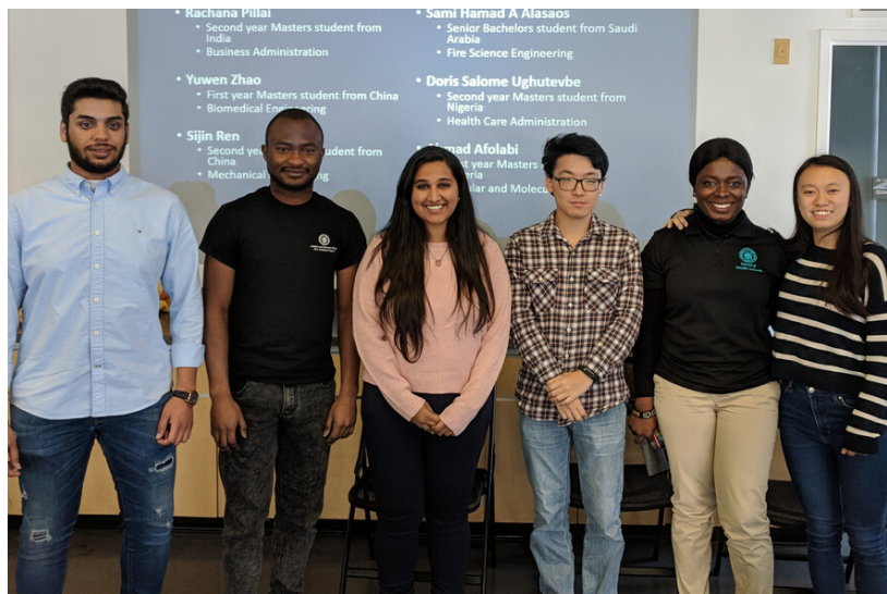
International Student Panelists