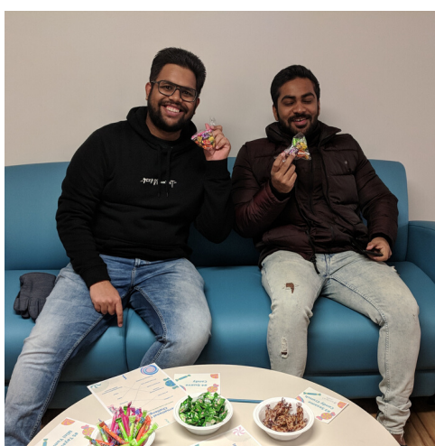
International Candy Break Challenge

Check out more pictures on our social media!