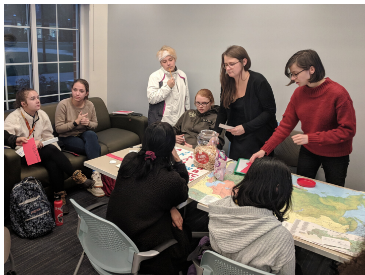
Learn to Write Your Name in Russian