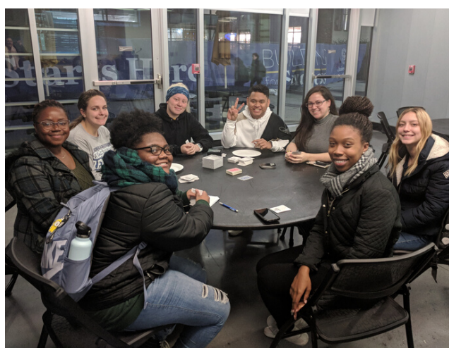
ISA International Mixer