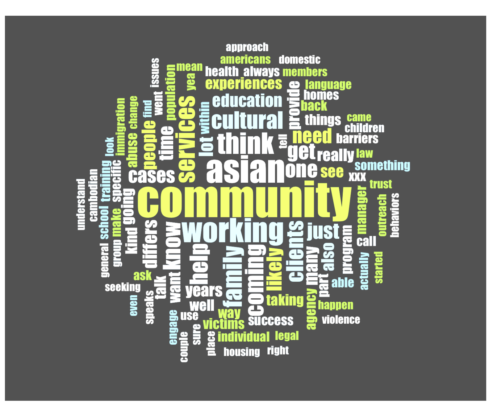
Figure 1. Word Cloud Depicting Frequencies Based on Transcribed Interviews