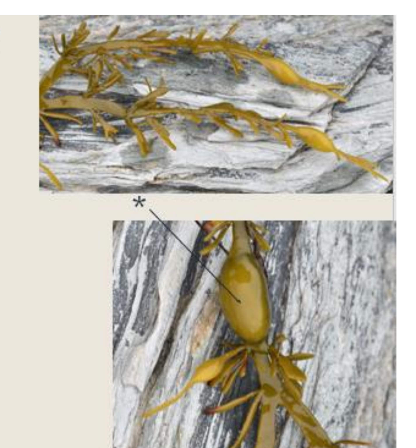
Figure 3: Sample of an algae page in the field guide