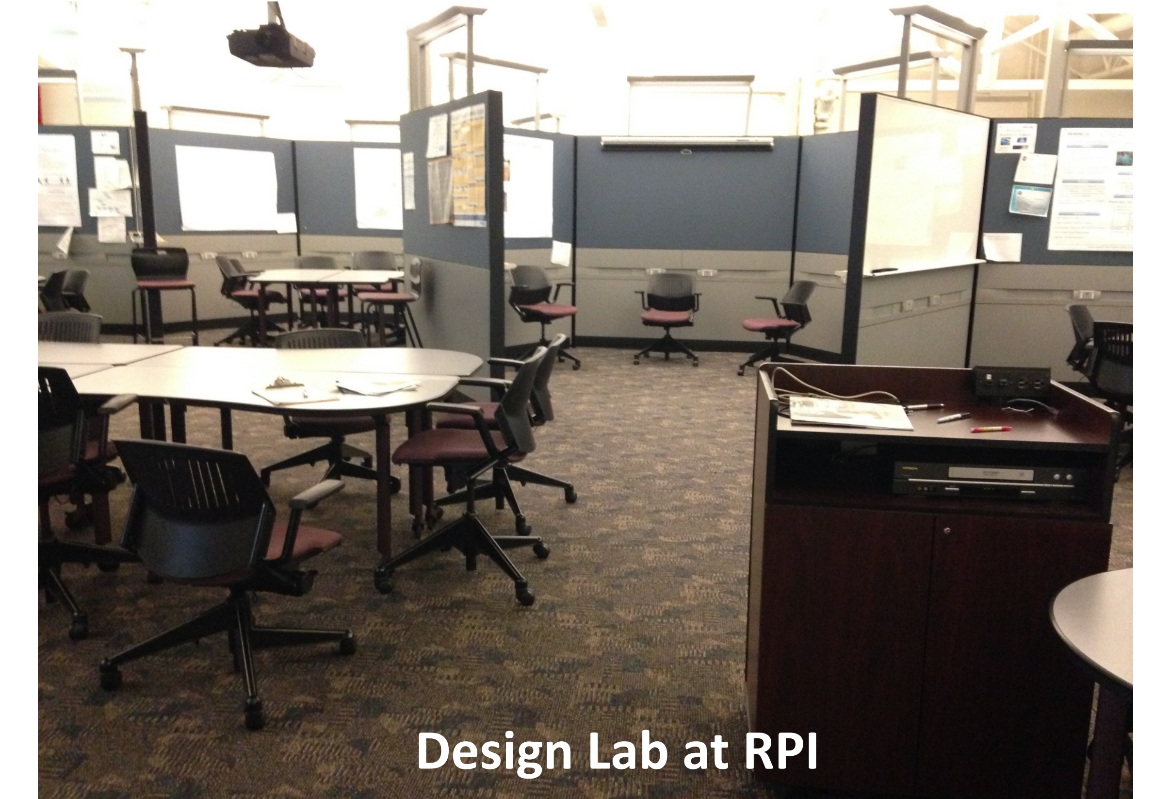
Design Lab at RPI