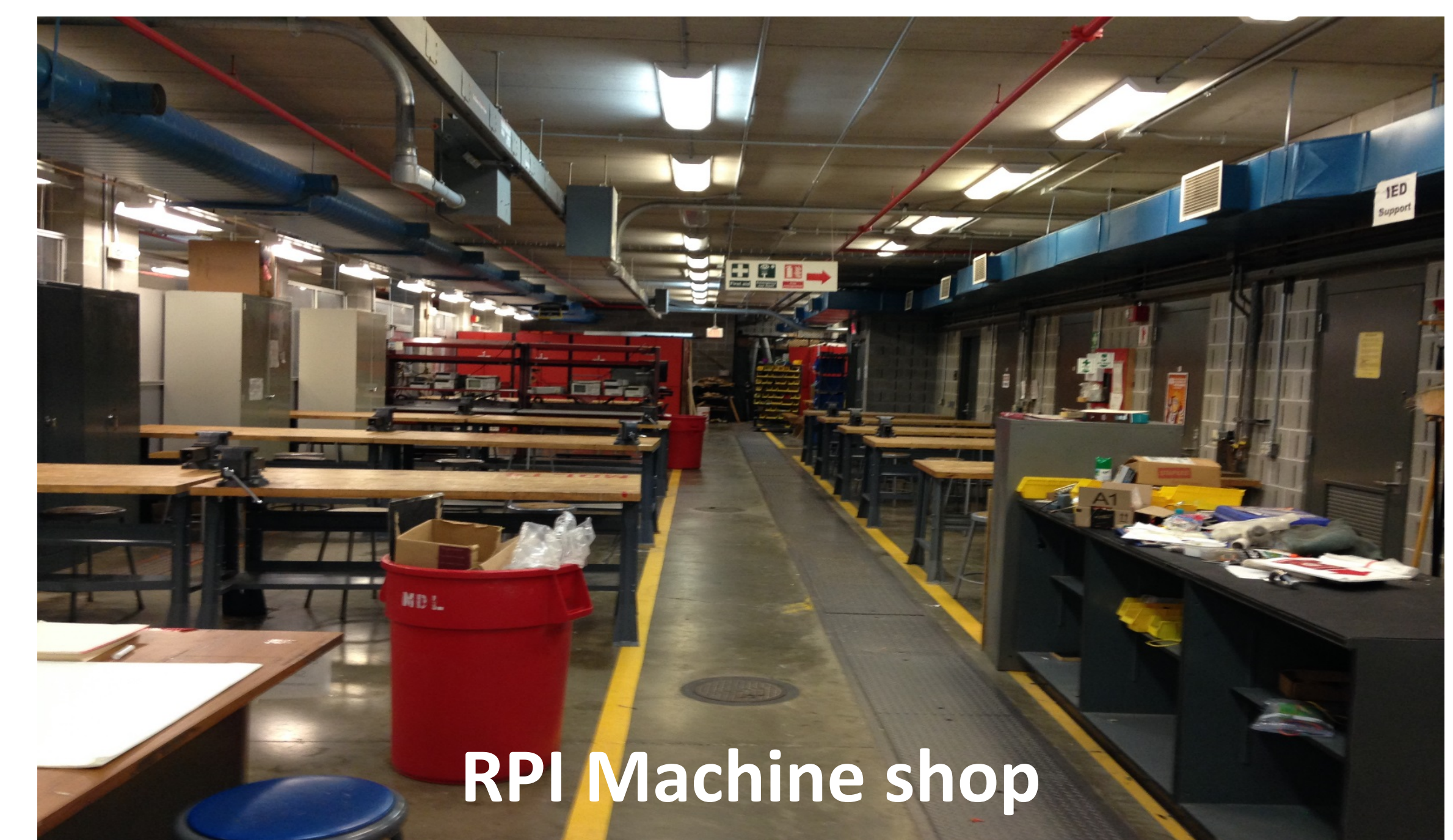
RPI Machine shop