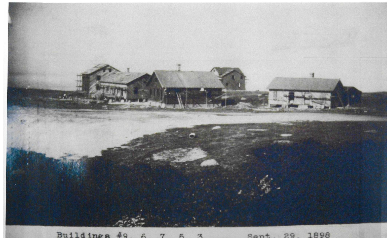
Left: A number of the initial Fort Terry structures.